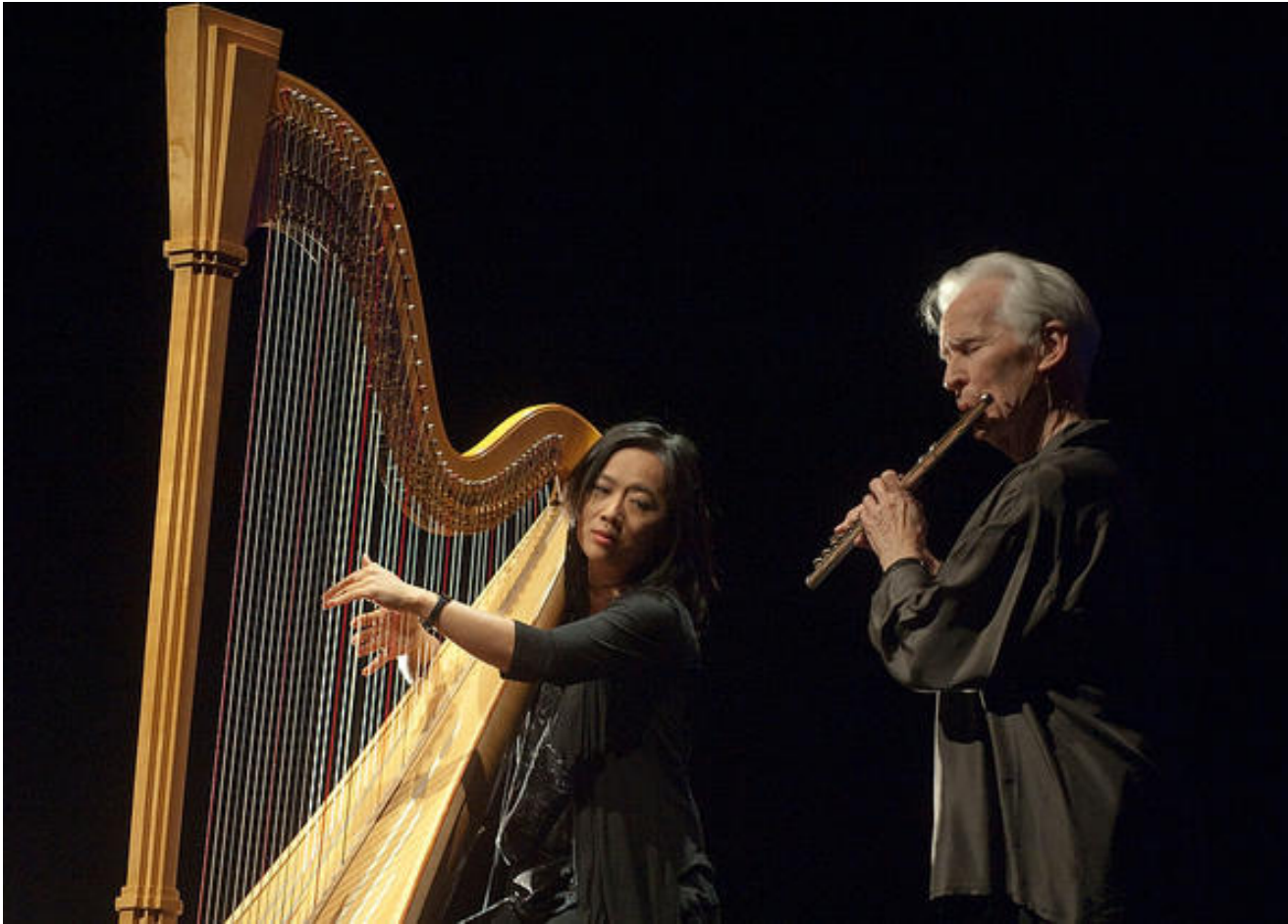
Tao of Bach rehearsal

Images from a rehearsal of Tao of Bach, which will be performed in the Tyron Festival Theater on Thursday, Sept. 13, 2012