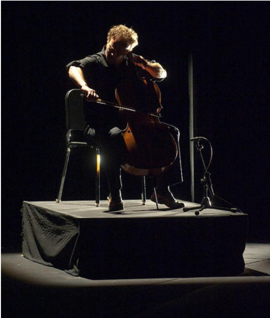
Tao of Bach rehearsal

Images from a rehearsal of Tao of Bach, which will be performed in the Tyron Festival Theater on Thursday, Sept. 13, 2012