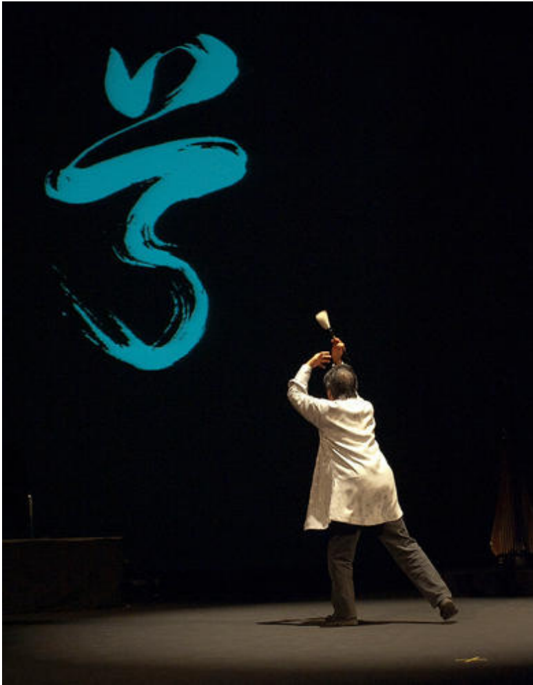
Tao of Bach rehearsal

Images from a rehearsal of Tao of Bach, which will be performed in the Tyron Festival Theater on Thursday, Sept. 13, 2012