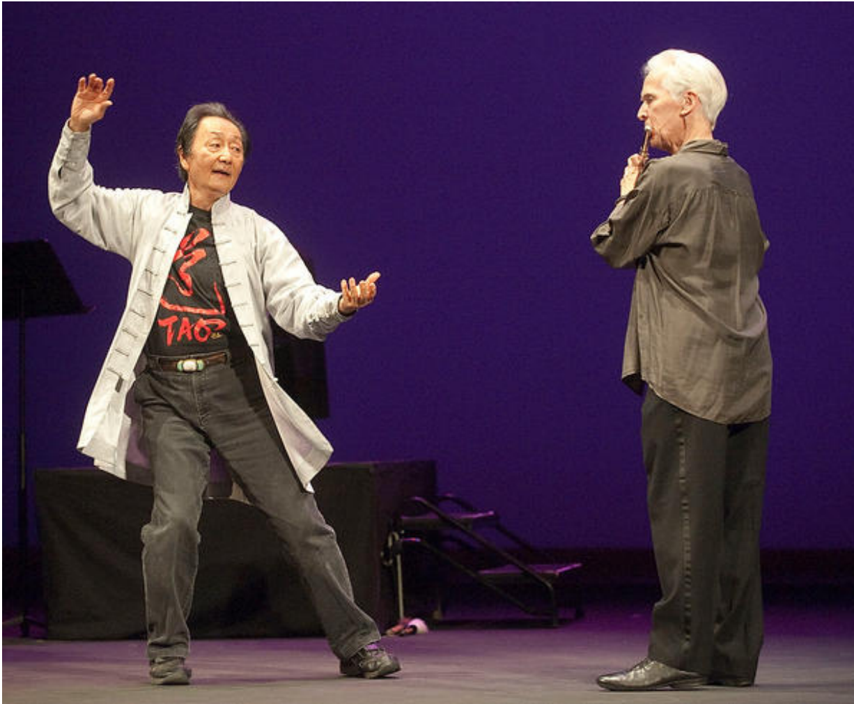
Tao of Bach rehearsal

Images from a rehearsal of Tao of Bach, which will be performed in the Tyron Festival Theater on Thursday, Sept. 13, 2012