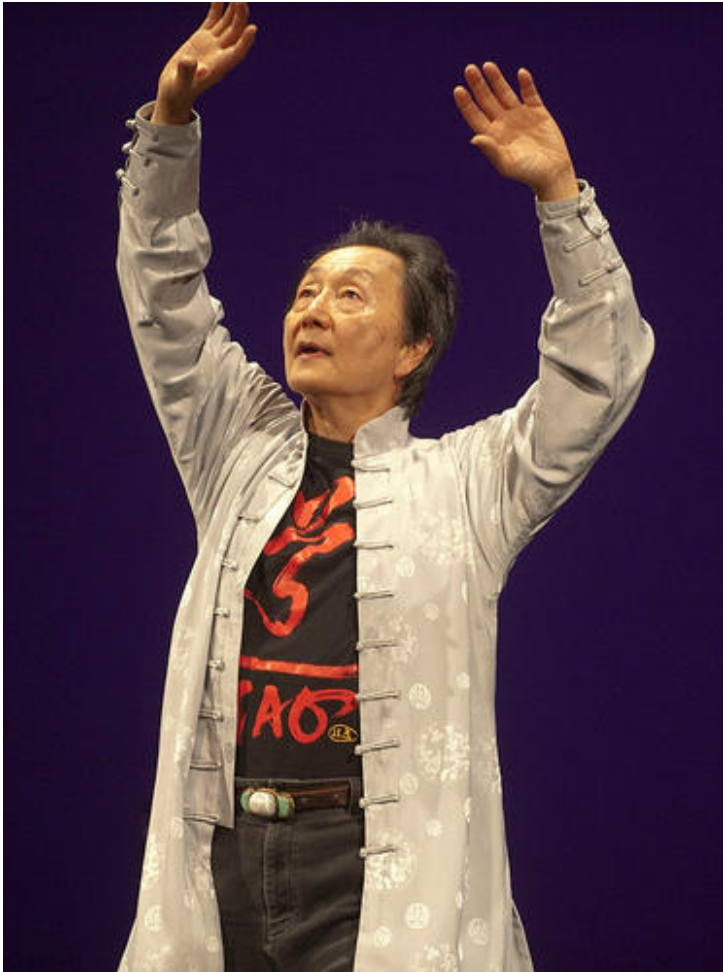
Tao of Bach rehearsal

Images from a rehearsal of Tao of Bach, which will be performed in the Tyron Festival Theater on Thursday, Sept. 13, 2012