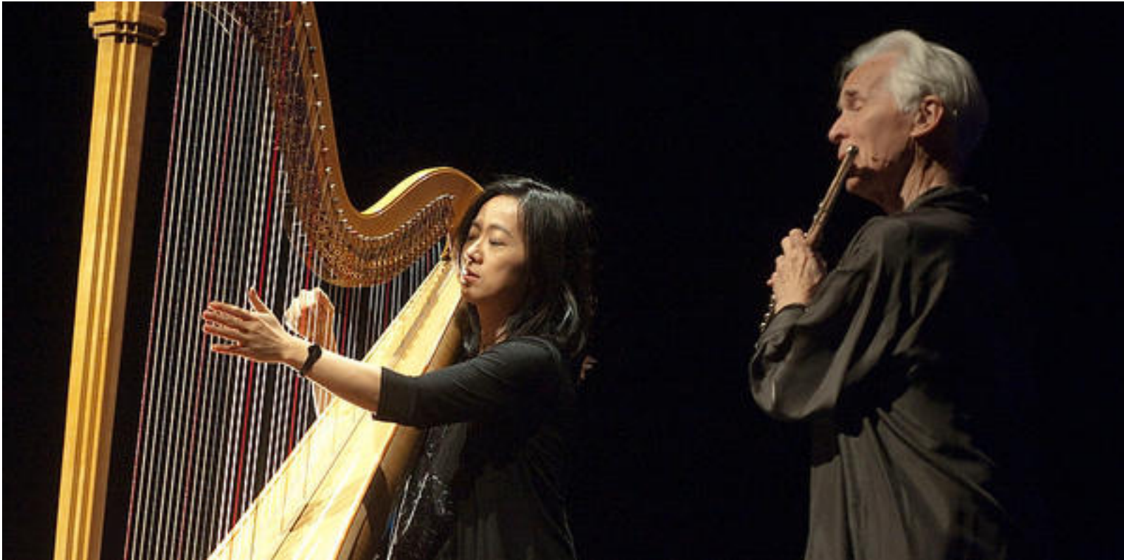
Tao of Bach rehearsal

Images from a rehearsal of Tao of Bach, which will be performed in the Tryon Festival Theater on Thursday, Sept. 13, 2012