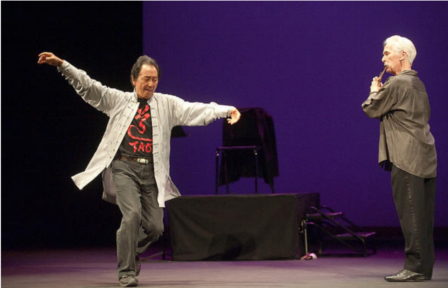
Tao of Bach rehearsal

Images from a rehearsal of Tao of Bach, which will be performed in the Tyron Festival Theater on Thursday, Sept. 13, 2012