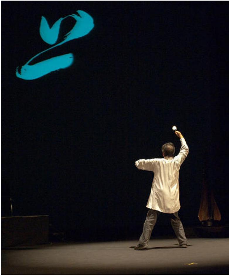
Tao of Bach rehearsal

Images from a rehearsal of Tao of Bach, which will be performed in the Tyron Festival Theater on Thursday, Sept. 13, 2012