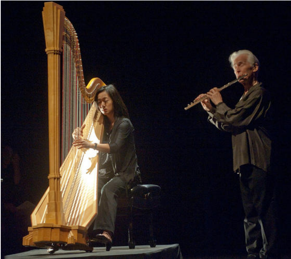
Tao of Bach rehearsal

Images from a rehearsal of Tao of Bach, which will be performed in the Tyron Festival Theater on Thursday, Sept. 13, 2012